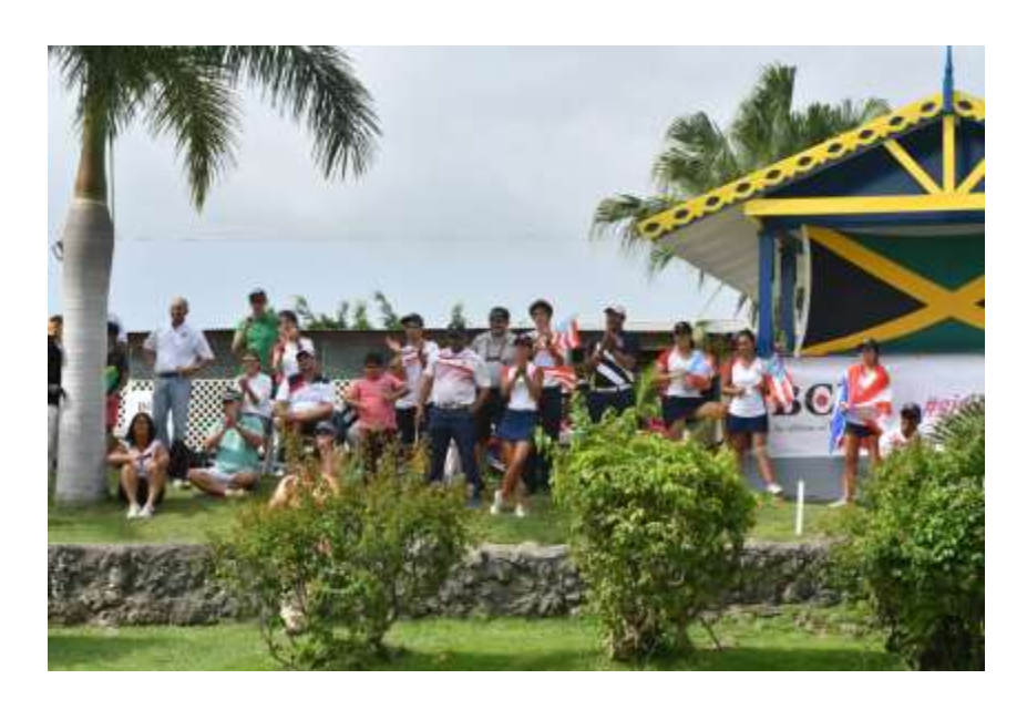
Excellent elevated bleacher spaces were available at finishing holes.

A large scoreboard was also mounted and manned at the back of the 9<sup>th</sup> green. The volunteer efforts were very noticeable on and off the course, they must be commended for a job well done to ensure that all tasks are complete and facilities are in place. A number of sponsors implanted their banners around the course and in the vicinity of the clubhouse.