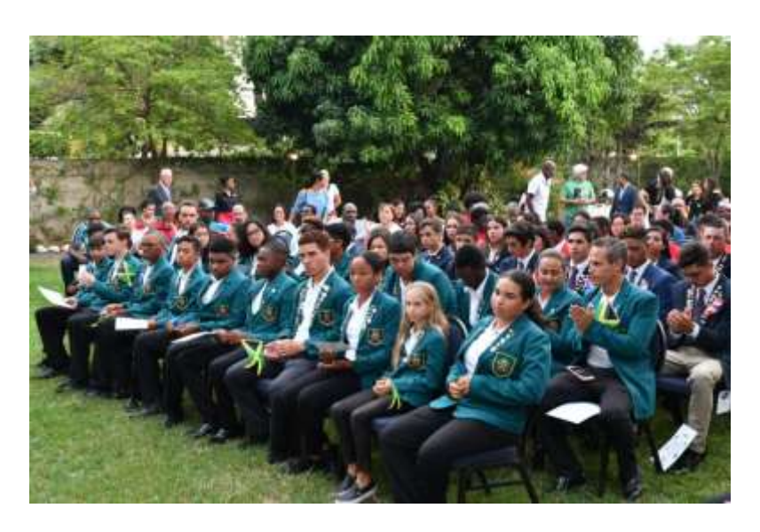
Team from host country - Jamaica